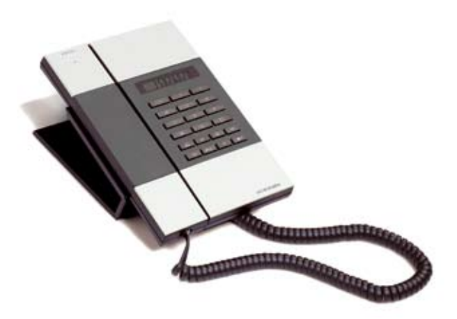
Telephone 3 Displays the number dialled. The telephone is equipped with a memory for the four most used numbers, ten secondary numbers and a redial function for the last number called. The R-key is for calls using a switchboard, with mute function in the handset and a high or low ringing tone adjustment.