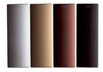
Handset Back Cover The handset is delivered with a silver coloured back cover, which can easily be replaced. Personalize your handset with a new colour; the covers are available in silver, gold, bronze and black.

Additional handset as well as a charger can be bought separately.