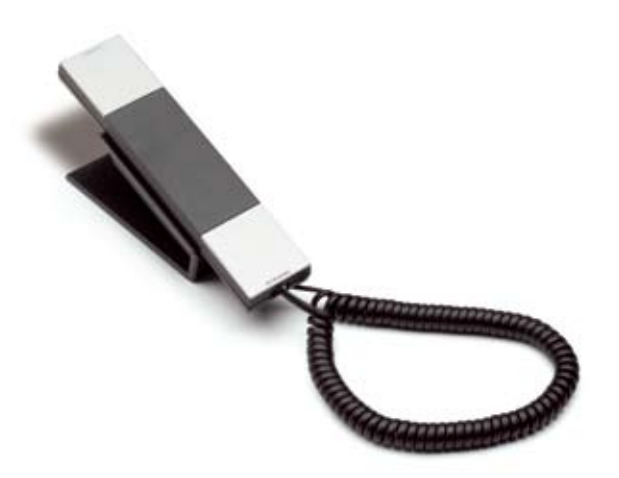
Telephone 1 A small and exquisite telephone. The keys placed on the stand, directly under the handset, make it easy to operate. The telephone is equipped with a memory for the most used number, ten secondary numbers and a redial function for the last number called. The R-key is for calls using a switchboard, with mute function in the handset and a high or low ringing tone adjustment.